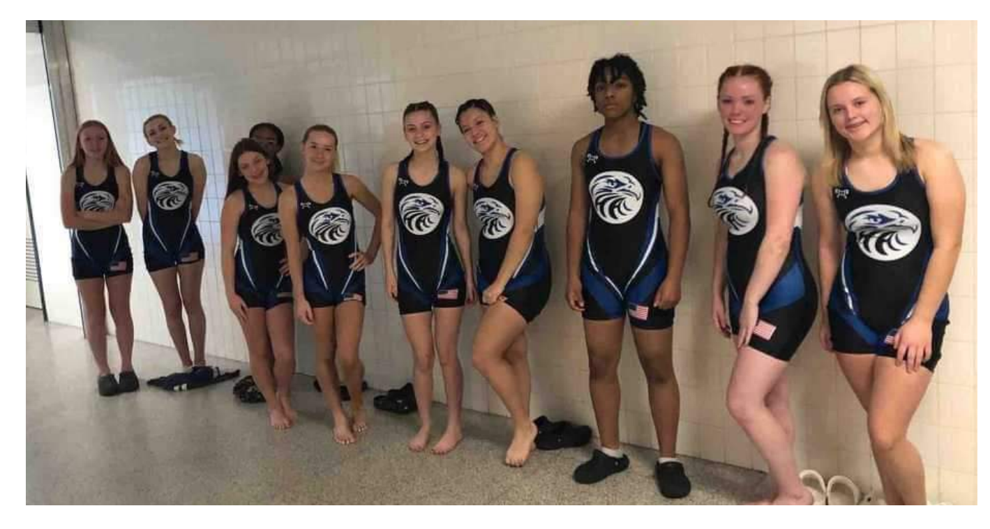
Hanover Area's first PIAA-sanctioned Girls' Wrestling Team wearing their new singlets

Despite it being only their first sanctioned year, the Girls' Wrestling Team had already built up a dedicated team over the years and an impressive goal: making it to states. With the immense amount of dedication, energy, and time that is put into the team, this goal is attainable, provided the team continues to keep up with its brilliant performance, with 13 girls on Varsity, and 5 on Junior Varsity. In the meantime, the team has daily practice, multiple scheduled tournaments, and weekly meets, as well as their weekend tournaments. With all of the hard work that each girl brings to the team, there is no doubt that we'll see great things from them not only this year but in the years to come.